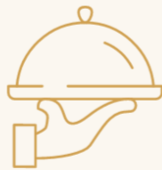
Upscale Casual Dining