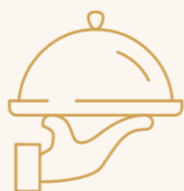
Upscale Casual Dining