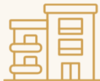
Office / Retail / Habitational Mixed Use