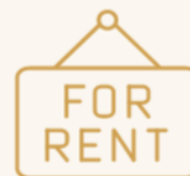
Rental Apartment Buildings