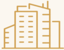
High Rise Buildings