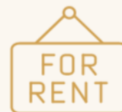
Rental Apartment Buildings