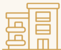
Office / Retail / Habitational Mixed Use