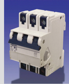
Branch Circuit Breaker 480V/20A